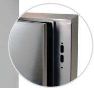
Continuous Foam Gasket