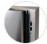
Continuous Foam Gasket