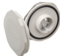
RMR Enclosure XL Polyvent Protective Vent Kit