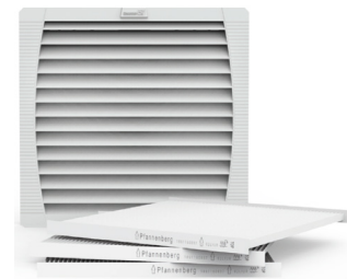
RMR Modular Filter Kit