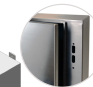
Continuous Foam Gasket