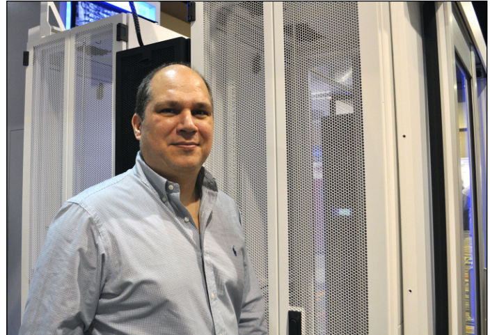
“I’m a very critical person. And I believe that our data center was given the best.”

The facility is divided in two 2,300 square meter (7,546 square foot) data center halls. The second data hall is scheduled to be fully operational in 2015. G+