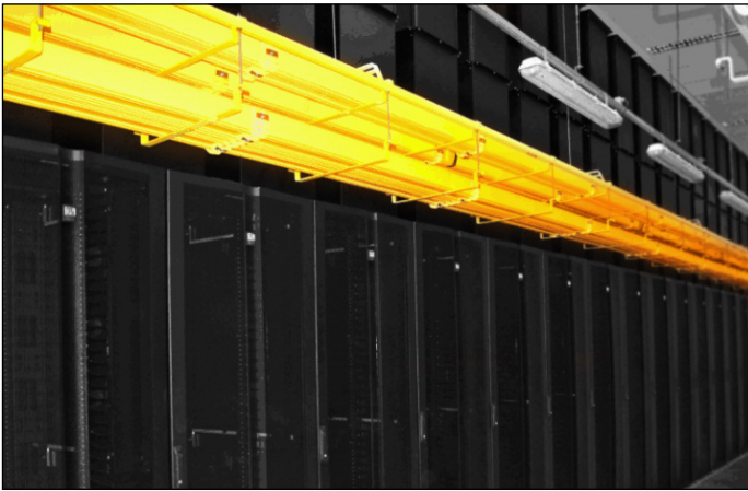
Vivo's data center has today 191 GlobalFrame cabinets with Vertical Exhaust Ducts that helped the company achieve Tier III facility status. (use this for the other image showing the VEDs.)

To date, CPI has provided Vivo with 191 GlobalFrame cabinets with Vertical Exhaust Ducts that are sitting on a 60-inch raised floor. Vivo is also using 97 cabinets for networking and 25 for cabling.