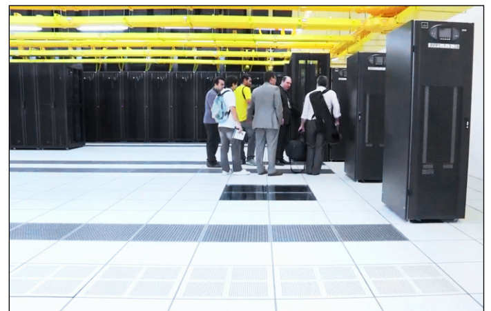
As visitors take a closer look at CPI's cabinets, they notice the superior quality right away, according to Mendonça. "They ask, 'Wow! Who made these racks?'"

The proof of this stellar performance is in the Power Usage Effectiveness (PUE) reading, which is currently even better than what was previously expected.