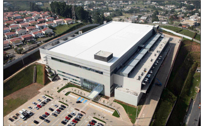
Telefônica Vivo planned its state-of-the-art data center to support the evolution of technology for the next 10 years or more.