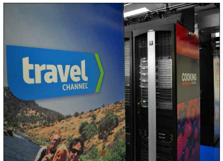
The Scripps Networks data center has become a showpiece.