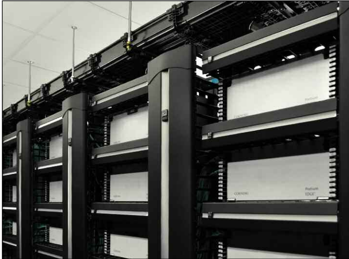
CPI's Two-Post Standard Rack and Evolution Cable Management manage Scripps Networks' fiber cross-connect.

flexibility of overhead power without compromising the passive cooling solutions it was looking for.