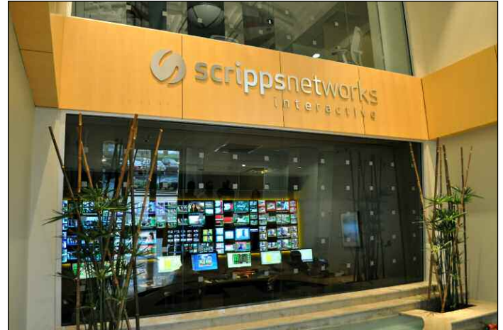
Scripps Networks Interactive is headquartered in Knoxville, Tenn., where it manages the data center operations for its lifestyle brands worldwide.