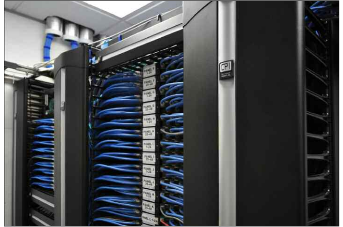
Evolution Cable Management is used in all of Scripps' IDF closets to save time and money on moves, adds and changes.

Scripps Networks also wanted to eliminate hot spots and be able to support up to 30kW per cabinet, as opposed to the current 6kW. The media