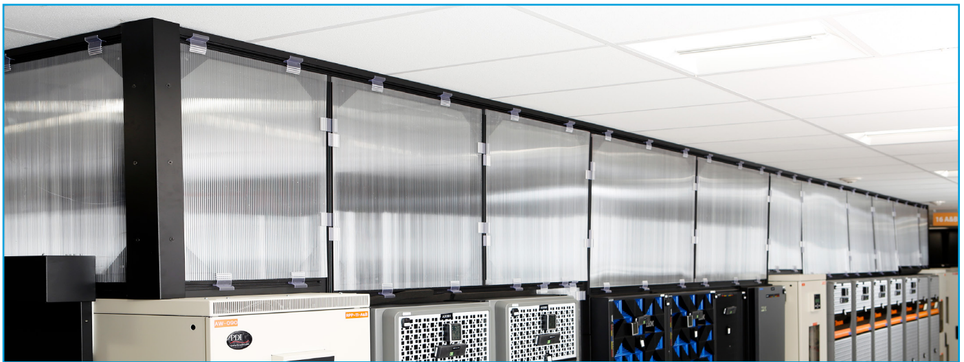
For airflow containment at the aisle level, the flexibility and onsite customization features of CPI’s Build To Spec Kit (BTS) Hot Aisle Containment (HAC) contains the hot exhaust generated by existing, multi-vendor cabinets.

The path to improvement began with a complete containment strategy at both the cabinet and aisle level, composed of CPI products that are now a standard specification for all Anthem data centers.