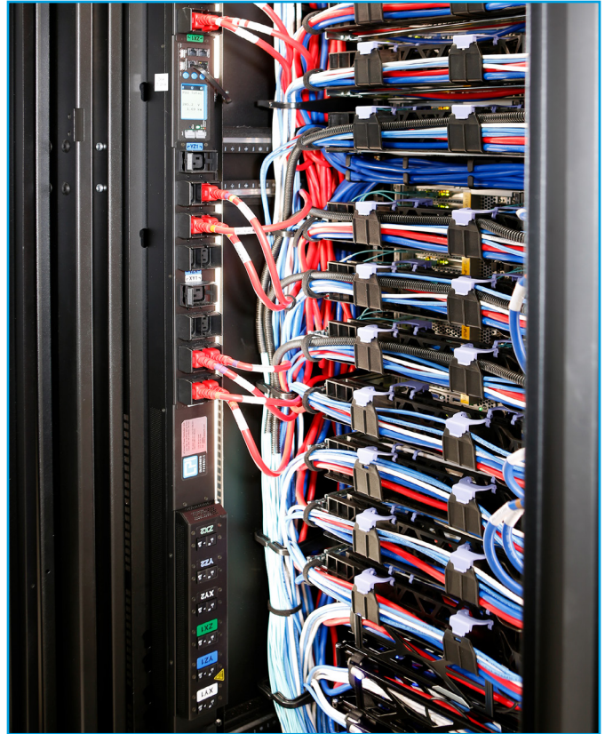
CPI’s Monitored eConnect® PDUs support two temperature and humidity probes providing temperature and humidity measurement at each cabinet, and feature Secure Array® IP Consolidation technology, which greatly reduces the number of networking ports required for the PDUs.