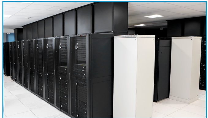
The cabinet solution includes CPI's GF-Series GlobalFrame® Gen 2 Cabinet with Vertical Exhaust Duct, Monitored eConnect® PDUs and cable management accessories.