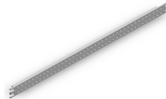
30016-X00 T-mounting bars Sold separately