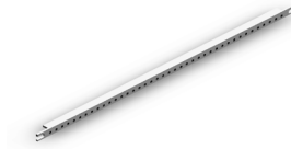
30015-X00 Angle mounting bars Sold separately