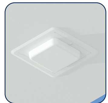
Model 1075-MPDOME shown

Note: Use 1075-MPDOME or 1075-MTDOME models for behavioral health applications.