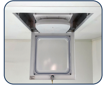
Model 1075-MPDOME with a Cisco C9136AXI Access Point Installed