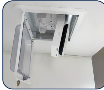
Model 1075-MTDOME with an Aruba AP-635 Access Point installed